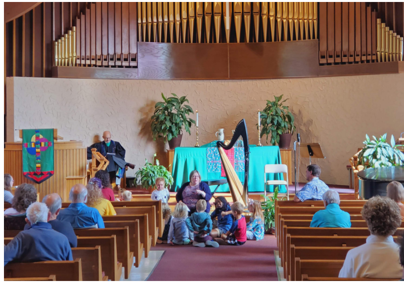
Seeing the Chancel full of kids on Sunday morning for the Children's Message never gets old. (Sept 17)