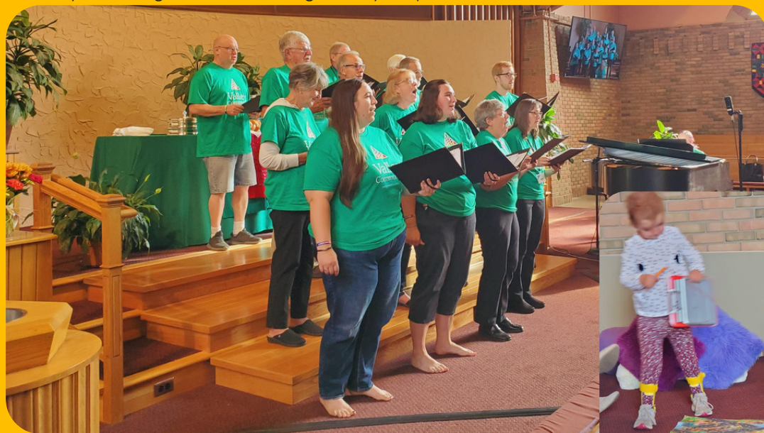
Valley kids exploring the area for young worshippers in the Sanctuary