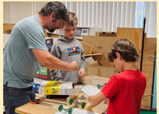
Exploring solar energy in TEAMS - Sept 2023