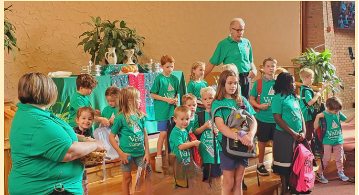
Blessing of the Backpacks on Homecoming Sunday September 2023