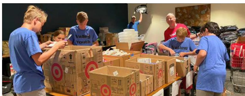
Valley Middle School Youth took part in three Mission Days this summer. One day in August was spent sorting school supplies at PRISM for their Back to School Success Drive.