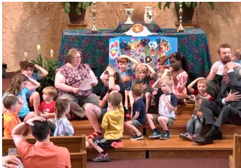
During worship on June 18, Valley kids shared about Compassion the theme of this year's VBC.