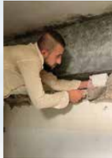
HOUSE RESTORATION - VILLAT

Each gift to One Great Hour of Sharing helps improve the lives of the suffering and the vulnerable through three life-saving programs ~