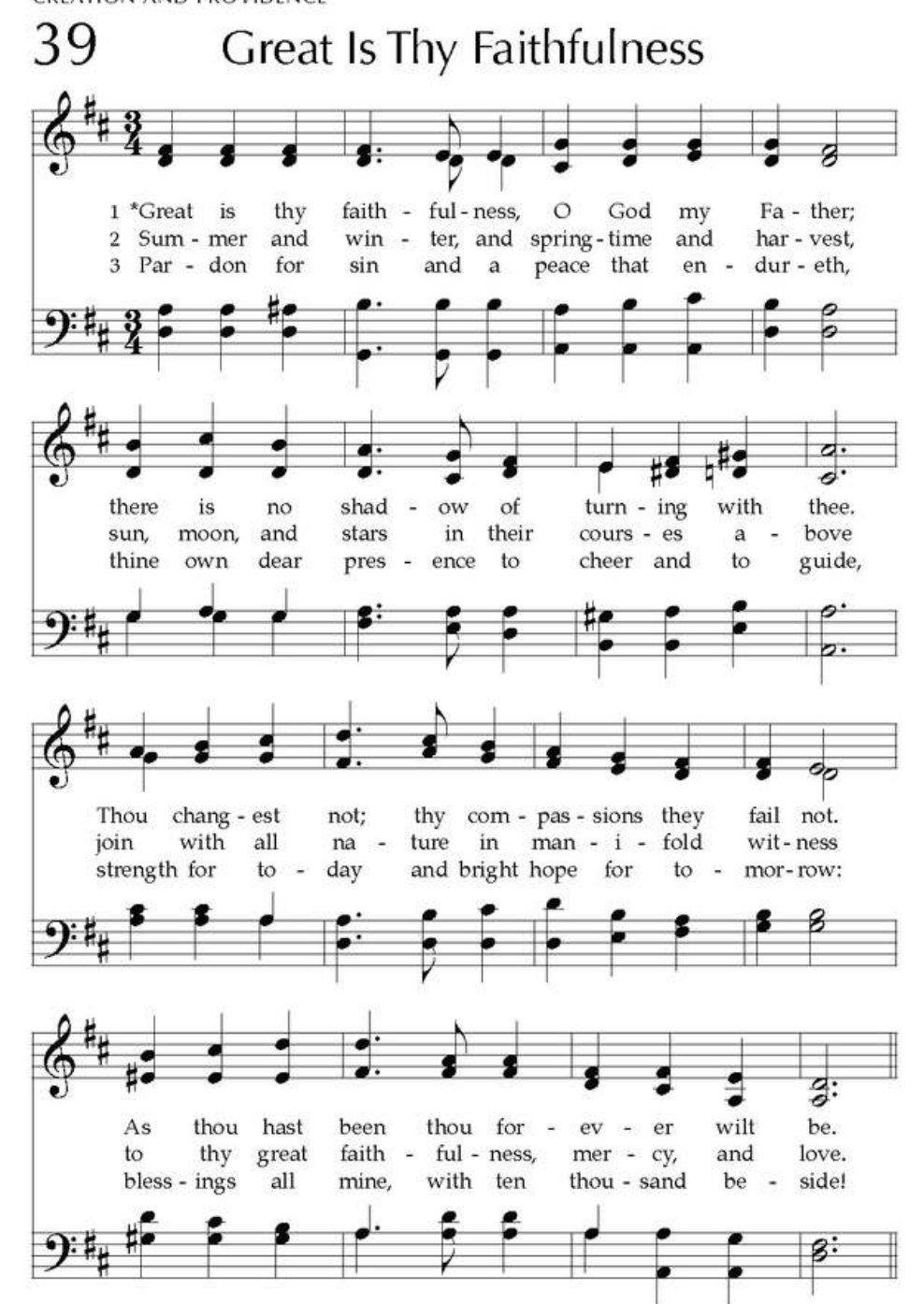
*Or "Great is thy faithfulness, O God, Creator."

Written as a meditation on Lamentations 3:22–23, this text is one of the few hymns among the 1200 poems by this Methodist writer and pastor that has gained much currency. The tune that appears here was composed especially for these words, and the pairing has proved enduring.