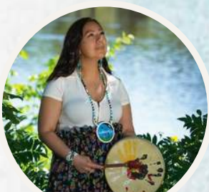
BLUE HUMMINGBIRD WOMAN

Ĥaĥa Wakpadaŋ is the Dakota name for Bassett Creek