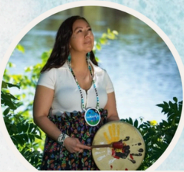
BLUE HUMMINGBIRD WOMAN

Ĥaĥa Wakpadaŋ is the Dakota name for Bassett Creek