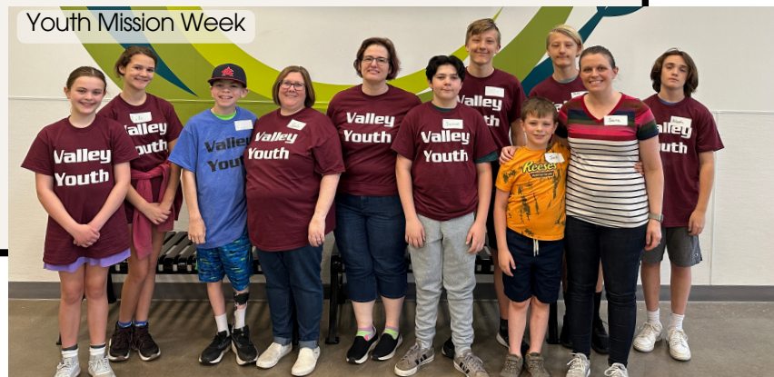
Youth Mission Week

ABOVE EXCERPTS TAKEN FROM MEMBER RESPONSES TO THE RECENT MINISTRY & MISSION STUDY CONGREGATIONAL SURVEY.