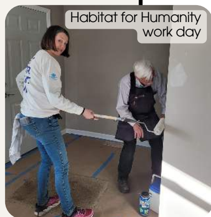
Habitat for Humanity work day

ABOVE EXCERPTS TAKEN FROM MEMBER RESPONSES TO THE RECENT MINISTRY & MISSION STUDY CONGREGATIONAL SURVEY.