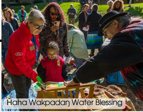
Haha Wakpadan Water Blessing