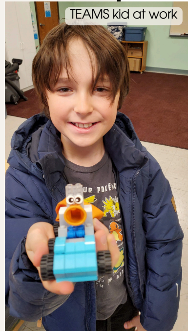
TEAMS kid at work

Valley is family for us. We live, laugh, and pray together! Our friends mean so much to us and we are there for each other.