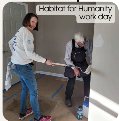
Habitat for Humanity work day