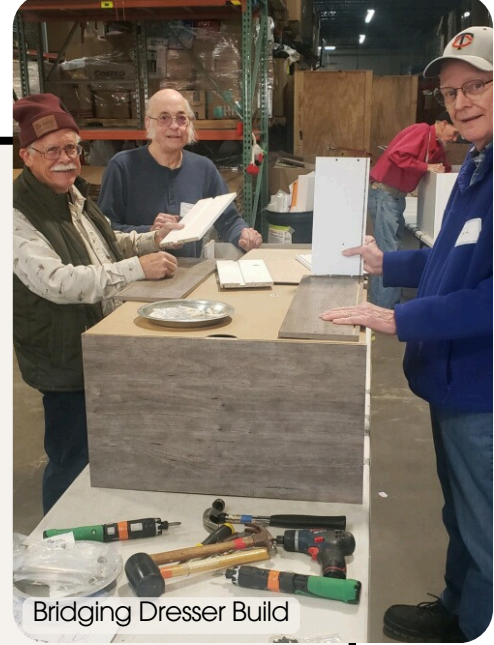
Bridging Dresser Build

I look forward to a sermon that challenges me to critically think about stories from the Bible or issues that are important for our congregation as it is involved with our community outside of the church.