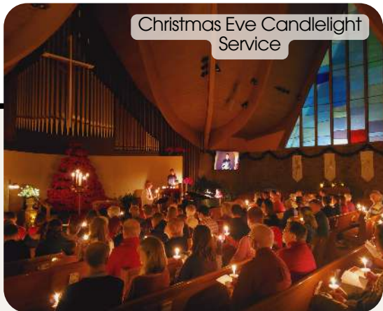
Christmas Eve Candlelight Service