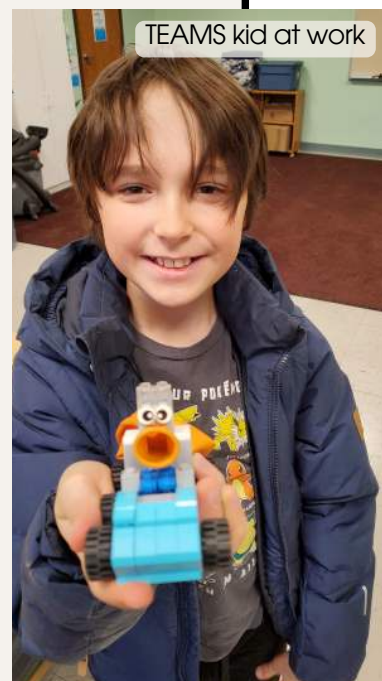
TEAMS kid at work

Valley is family for us. We live, laugh, and pray together! Our friends mean so much to us and we are there for each other.