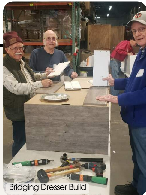
Bridging Dresser Build

I look forward to a sermon that challenges me to critically think about stories from the Bible or issues that are important for our congregation as it is involved with our community outside of the church.