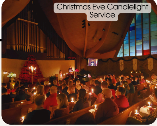
Christmas Eve Candlelight Service