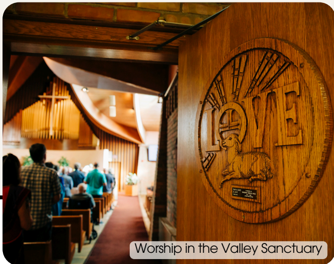
Worship in the Valley Sanctuary

ABOVE EXCERPTS TAKEN FROM MEMBER RESPONSES TO THE RECENT MINISTRY & MISSION STUDY CONGREGATIONAL SURVEY.