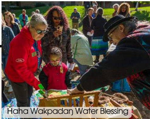
Haha Wakpadan Water Blessing