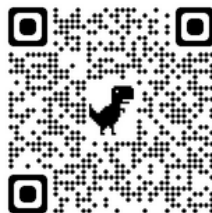
Scan to give online!

3100 Lilac Drive North Golden Valley, MN 55422 www.valleychurch.net Office: 763-588-0831 Pastoral Care: 763-445-9665 Phone Ministry: 763-220-1455