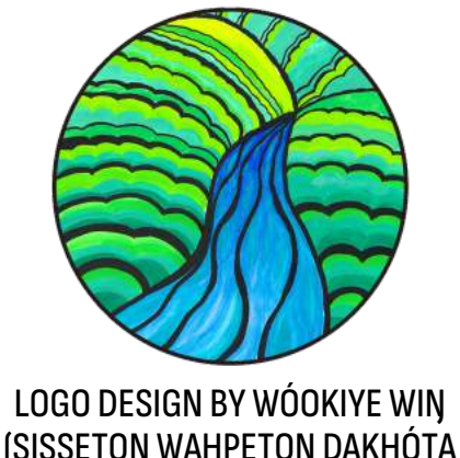
(SISSETON WAHPETON DAKHÓTA AND OJIBWAY)

We acknowledge the ongoing injustices that we have committed against the Dakota people and pledge to interrupt this legacy. We will educate ourselves about Indigenous history and recognize, support, and advocate for our Native neighbors.