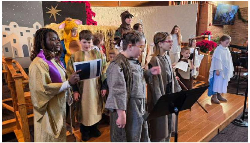
Valley kids and youth sang, performed, and shared their light with all of us on Pageant Sunday.