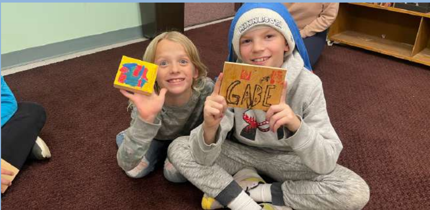
TEAMS KIDS AT WORK!

Classes will resume on March 1, 2026 and will meet in the Cornerstone Room at 11:00 AM unless otherwise noted.