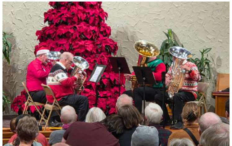
The Above Average Tuba Quartet once again treated us to an amazing Fridays in the Valley concert in December 2025.